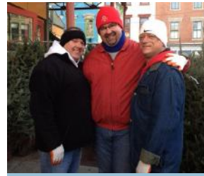
I.S.Q.C.C.B.E. members take a break from heavy lifting.

Caracole returned to the historic Findlay Market this past winter for the fourth year in a row to sell Fraser firs and Scotch pines during the holiday season! Friends of the agency travelled down to Over the Rhine to buy trees, wreaths and white pine garland from the best selection in town!