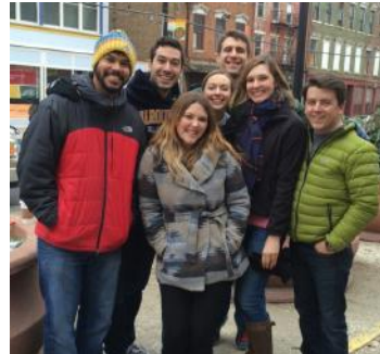
Left: Team Members from GYRO take a break after a cold afternoon selling Christmas trees. Right: Employees from Toyota gathered together to display some of our best garland and small trees!

Special thanks to The Corporation for Findlay Market and the more than 125 volunteers who donated their time to help prepare 473 trees for their journey home. We are grateful to our friends from Toyota, GYRO, Ethicon, the Infectious Diseases Center, Miami University, Greenpeace and the I.S.Q.C.C.B.E for gathering troops to sell trees at the Market in all weather conditions!