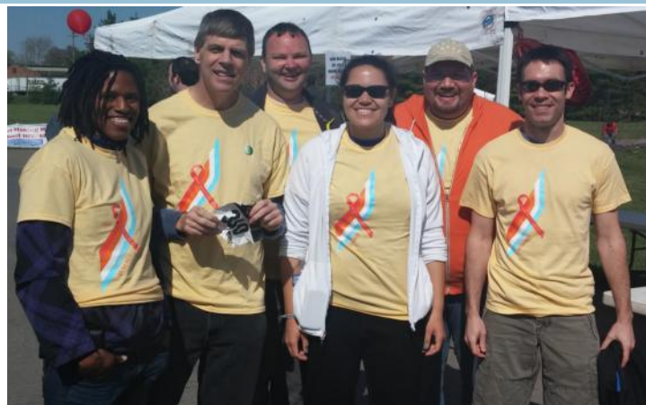
Volunteers from Procter & Gamble's Young William Cooper Proctor Society take a break from the action at Caracole's First 5K for AIDS last April.