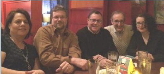
Left: Caracole supporters gather at Bella Luna for some Italian dishes in February for Dining Out For Life®

More than 25 restaurants participated in Dining Out for Life® 2015 in Cincinnati! Caracole supporters gathered at eateries all over the area from Northern Kentucky to Hyde Park to West Chester on Tuesday February 3rd to support our mission! With the help of numerous restaurant hosts and ambassadors, Dining Out For Life® 2015 was a wonderful success with good laughs, good friends and most importantly - good food! We would like to send a shout out to our founding restaurants Arnold's Bar and Grill, Below Zero Lounge, Blue Jay Restaurant in Northside, Buz, Green Dog Café, Kitchen 452, Unwind Wine Bar and Washington Platform Saloon & Restaurant! We are so lucky to have great friends in our community!